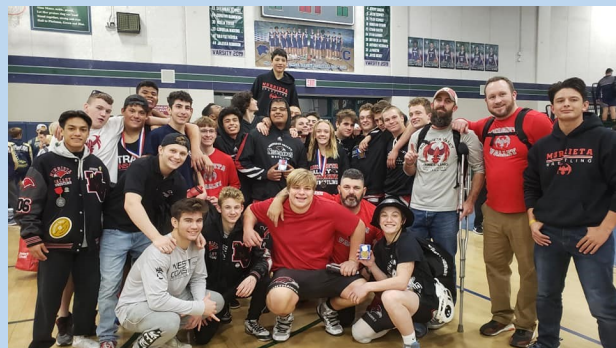
Members of the MVHS Wrestling Teams, several of whom are headed to CIF