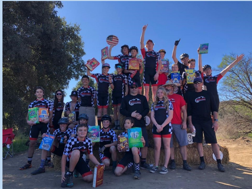
MVHS Mountain Bike Team placed first in the Paper Plate Preliminaries