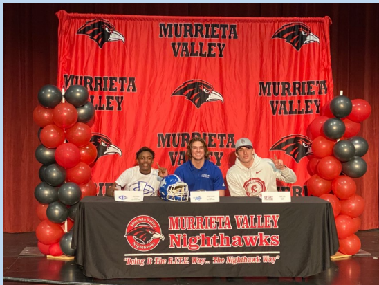
Signing Day for some of our athletes