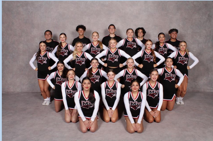
MVHS Varsity Small Co-ed placed 6th in the NATION! UCA-FL